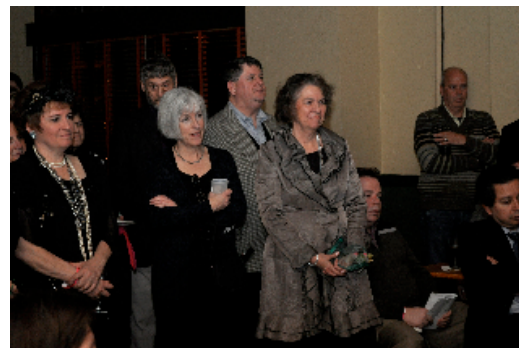
Parenthesis Family Center